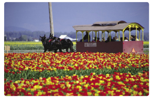
Tulip Fields in the Skagit Valley

Day 2 > Though only sixty-five miles, your journey will take a while as it will be through some very scenic locations as you head toward the North Cascades National Park. You will be following the