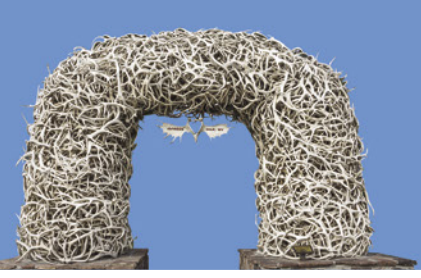
Elk antler arch, Jackson

Day 13 > 110 miles to Everett to Drop off your motorhome. For ease and comfort on this itinerary we would recommend you purchase the Early