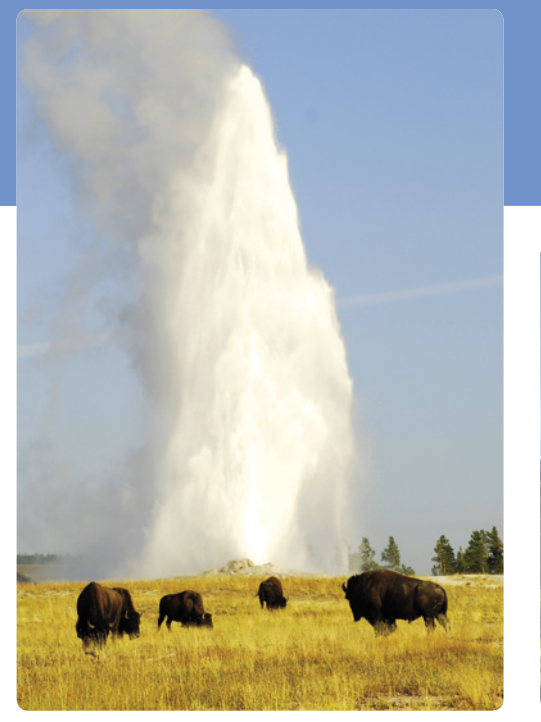
Buffalo in Yellowstone NP

flows you'll see a torrent of water spilling over the falls that originally gave the city its name. Situated on the Snake River, just off Interstate 86, exit 28, Massacre Rocks State Park is open year round and covers approximately 1,000 acres. Rich in history, as wheel ruts from wagons on the Oregon Trail still show, pioneers used this area as a rest stop for years. Many emigrant names are inscribed on Register Rock which is now protected by a weather shelter. The State Park campsite is home for tonight. © 55 miles to Massacre Rocks State park at American Falls ★ Visit The Lavas, caves and rock flows just outside Idaho Falls. © https://goo.gl/PnwvkC