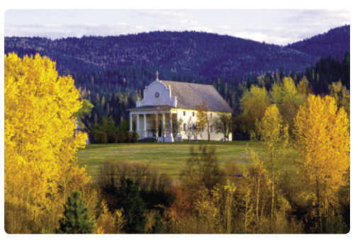
Cataldo Mission outside Coeur d'Alene

Day 6 > South-east towards Yellowstone National Park. You should leave the Interstate at Belgrade and head south on the scenic Route 191, through the Gallatin National Forest and past the Big Sky Resort. You'll enter through the West Entrance and, if you've got time, Yellowstone is definitely the place to spend that extra day, or even longer. Most of the major and iconic sites are on a loop. It's under a hundred miles round but, traffic jams around here are caused not by visitors but whenever the local wildlife decide to walk, sit or lie close to or even on the road. You'll not move a buffalo and, if you're lucky enough to find it's a bear or a moose up ahead, you'll want to stop just as everyone else will. Coming in from the West and heading out to the South means that, whichever way round you choose, there will be a section you drive twice. In this case it's the road by Fountain Paintpot and Old Faithful so it's no hardship. There are several campsites on the loop as well as near the entrances. The website has all the information. © 180 miles to Yellowstone National Park ★ Visit Mammoth Hot Springs; Grand Canyon of Yellowstone; Inspiration and Artist Points: all within Yellowstone National Park. www.nps.gov/yell/planyourvisit/campgrounds.htm