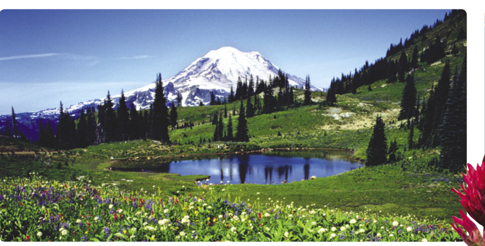
Mount Rainer National Forest

Ferry and continue through the Snake River Birds of Prey Natural Area, rejoining the freeway just north of Meridian where you will have to head south for a couple of miles to reach your campground just outside of Boise. 210 miles to Boise * Visit the glittering cascades at Thousand Springs, just past Twin Falls and then Bruneau Dunes south of Mountain Home.