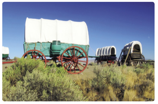
Circle of wagons, the Oregon Trail

As you drive south on Hwy 15 today, you will pass through the Fort Hall Indian Reservations. A 'must see' is a collection of Native American art and artefacts at an unusual shop called The Clothes Horse. Over generations the Shoshone Bannock tribes have developed a particular style and quality which is considered world class, some of their pieces are even on display at the Smithsonian in Washington, DC. Turn off on Hwy 86 towards American Falls. During high water